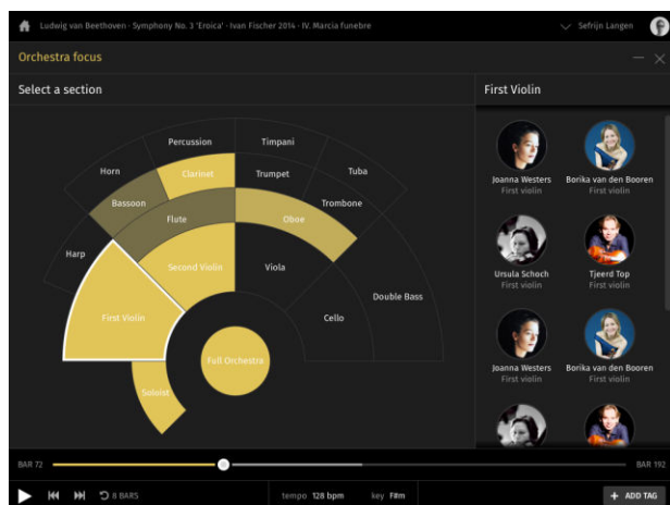
Figure 2 Visualization of instruments playing

During the concert users can follow a feed of comments on their tablets. The comments are authored by an editor or by other users in the hall. Whereas traditional program notes offer background information without an audible link to the music, the timed editorial comments help users connect relevant information on the concert timeline to audible events. For example, Richard Strauss’s ‘Eine Alpensinfonie’ describes the wonders of hiking through the Alps. During the performance, users could read the following explanation at the time it mattered: “ And then comes the calm before the storm. (...) The wind starts to pick up. We hear descending scalar figures from the introduction. The finale of the symphony begins. ”